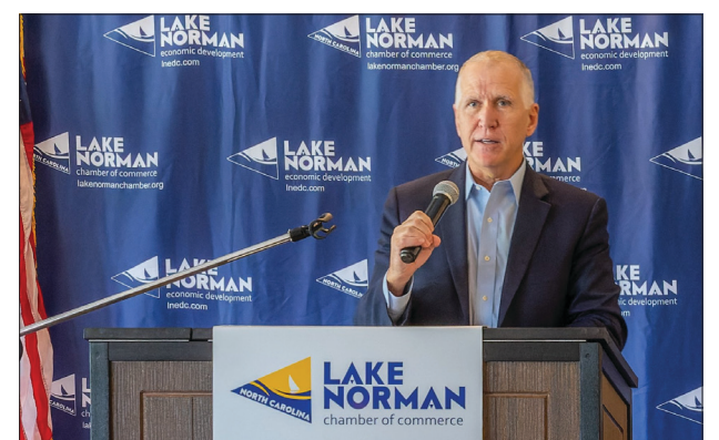
US Senator Tom Tillis

While I cannot say I always agreed with positions he took, I can say he believed every decision was made in the best interest of his constituents. But what I found most remarkable about Thom was his approachability. He never failed to make