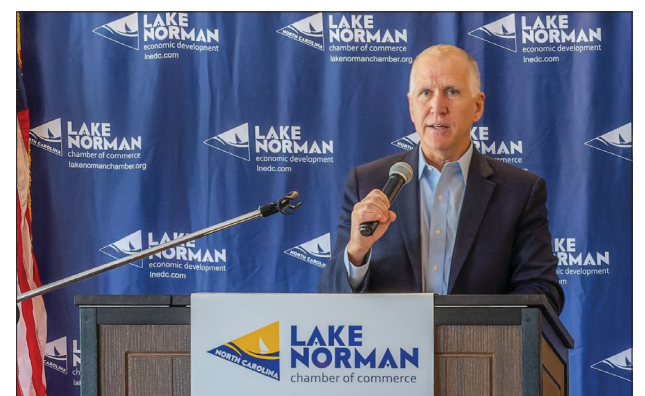
US Senator Tom Tillis

While I cannot say I always agreed with positions he took, I can say he believed every decision was made in the best interest of his constituents. But what I found most remarkable about Thom was his approachability. He never failed to make